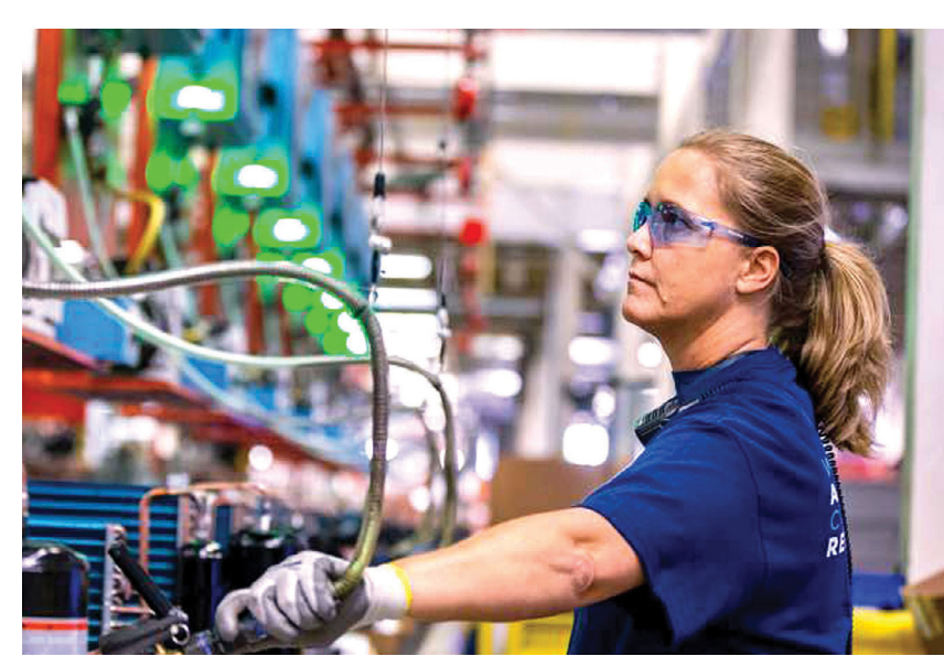
Employees lack sufficient skills to manage growing cybersecurity vulnerabilities on the plant floor, according to CyManll. The effective cyber workforce gap is only getting bigger.

CyManII believes a large part of its mission is to continue driving a cultural shift in manufacturing cybersecurity akin to